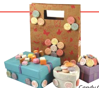
Candy Gift Boxes