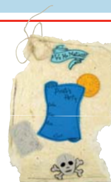
Pirate Party Invites